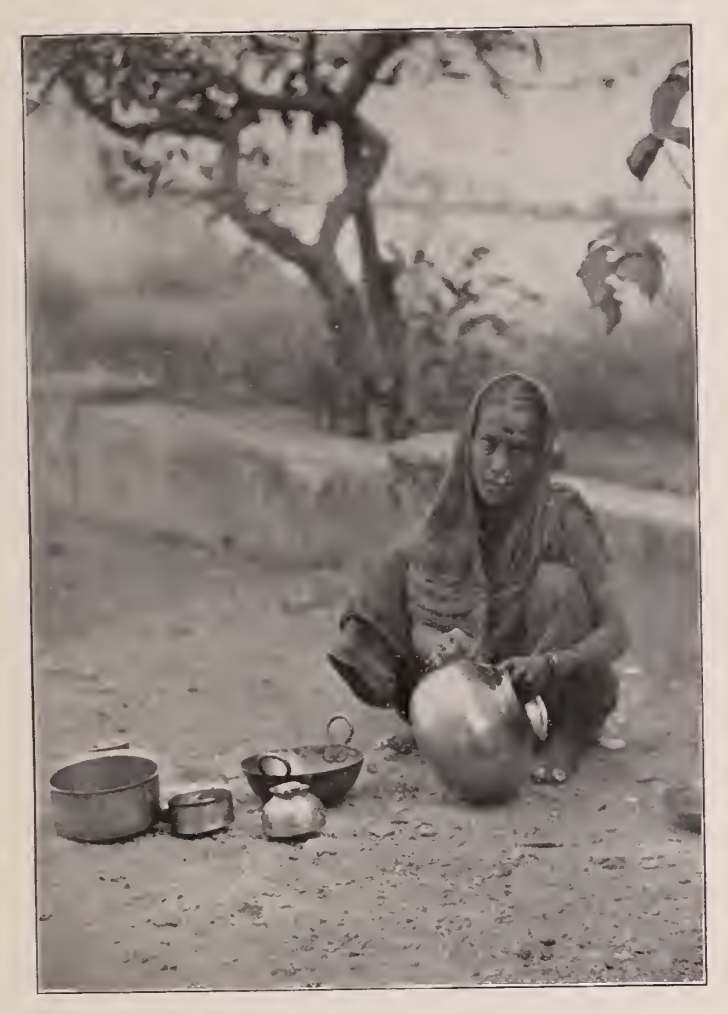
A Little Daughter-in-law Scouring the Degchas